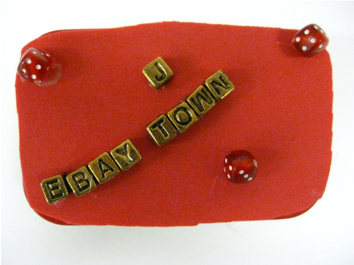
Ebay Town Ebay G.