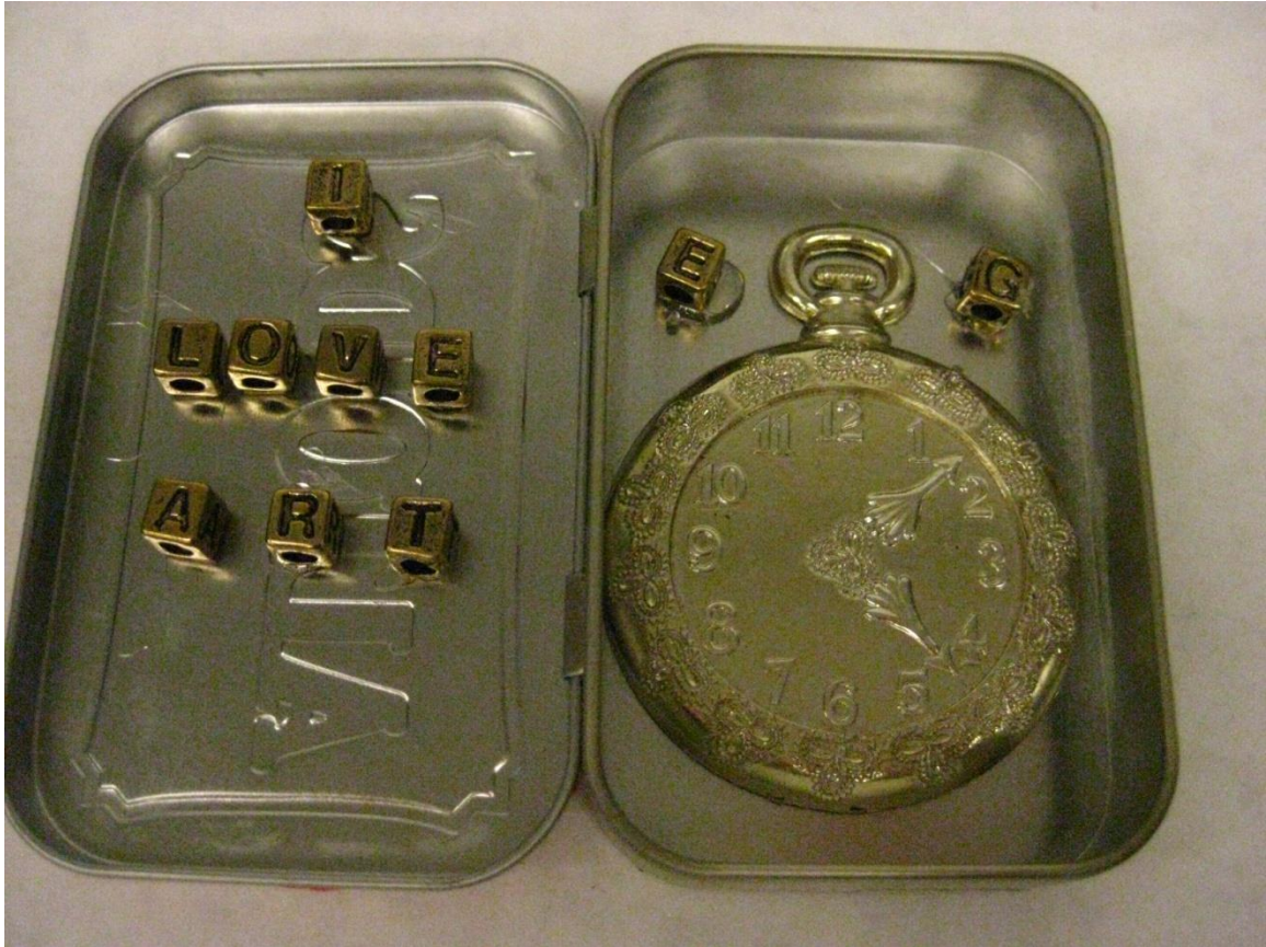
I Love Art Ebay G.