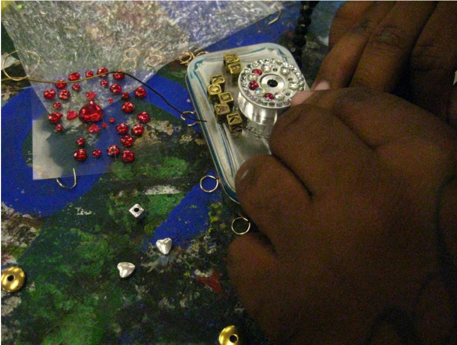
Camera Delphon B.