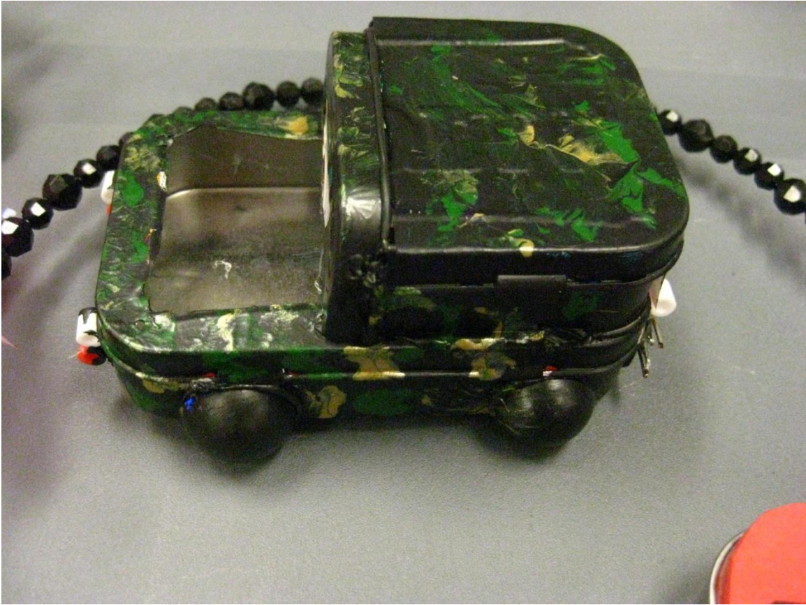
Army Truck Jabar O.