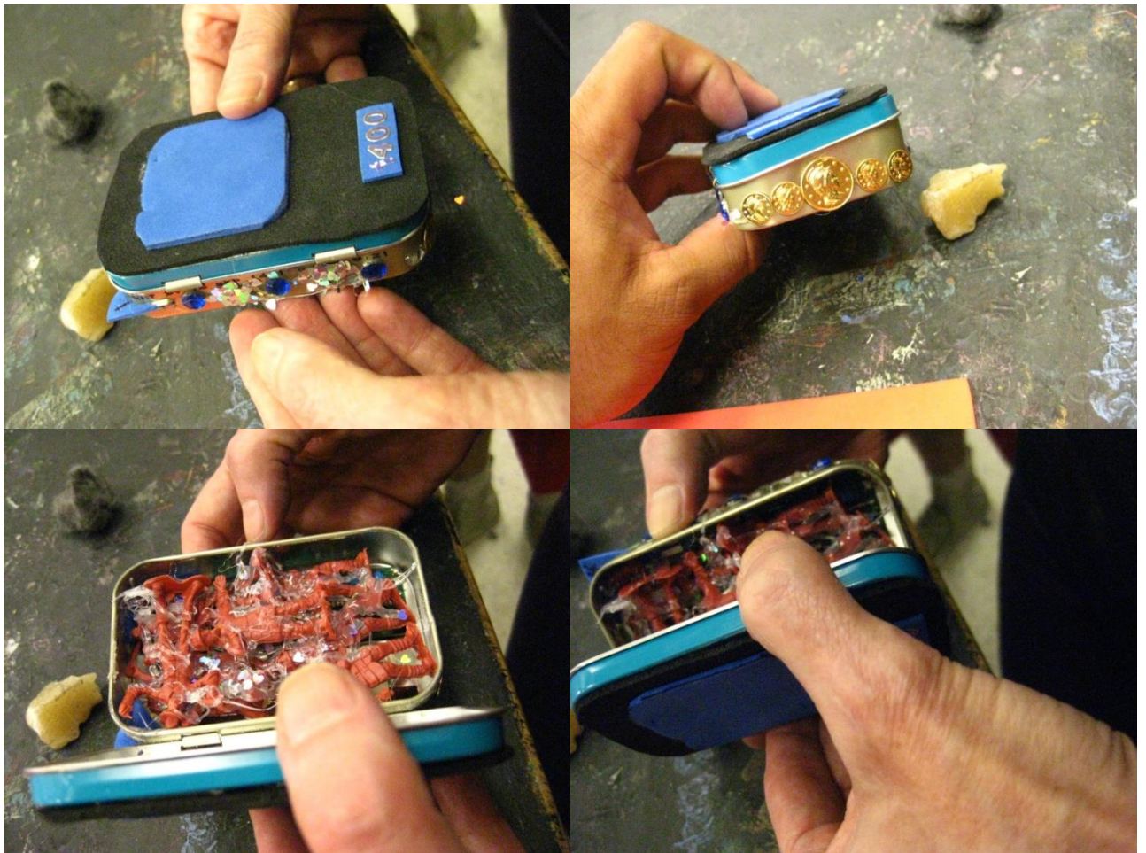
Working Scale Jabar O.