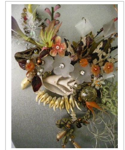
"Echoes of Vestige" 2013 The New Collective / Pittsburgh Center for the Arts